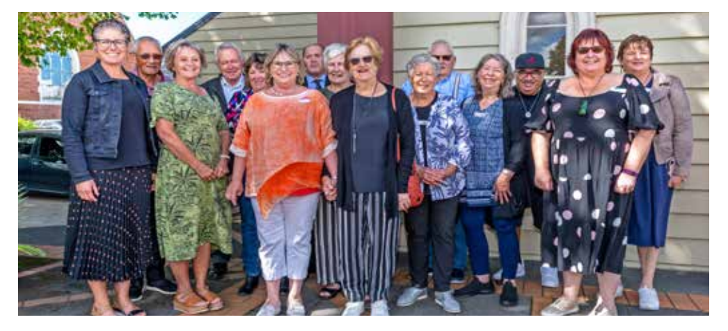
Pictured above are some of the staff, volunteers, funders and stroke survivors who met to celebrate Stroke Tairāwhiti's 35th birthday and recent amalgamation with Stroke Foundation New Zealand.

All donations stay local, helping support people and their whānau affected by stroke in Tairāwhiti.