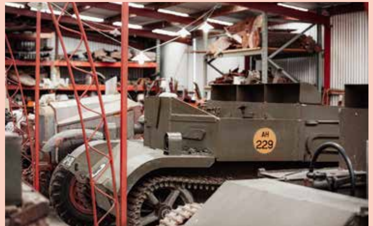
Bren Gun Carriers are on display to the public in ECMoT's military section, located in Barn 3.