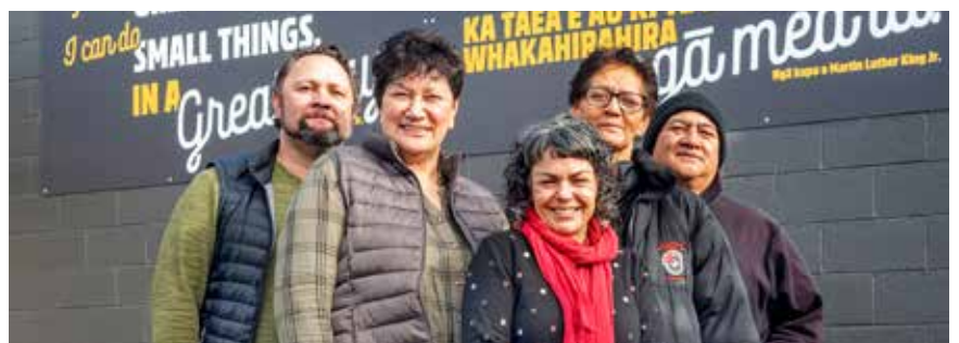
The Turanga Health team (pictured here) have been donating since we began. Their contribution will continue to make a difference to groups in our community every year, forever.