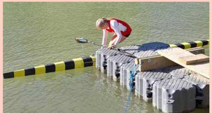
Poverty Bay Kayak Club purchased a new pontoon with their Sunrise grant to replace the one they lost in Cyclone Gabrielle.